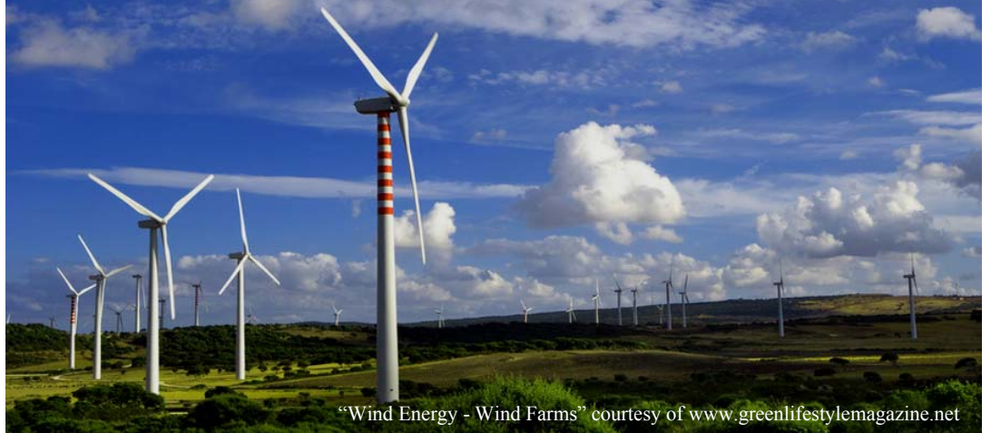
“Wind Energy - Wind Farms”

The increased focus on alternative energy sources has brought about significant expansion in this sector of the energy industry. As a result, construction of facilities dedicated to the research, development, and production of alternative energy has in-