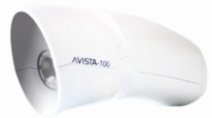
Homeland Security NewsWire

streets, design real time traffic signals, and multiple speed limits to make traffic flow more smoothly.