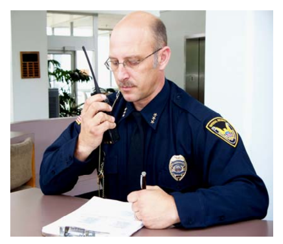
Retail Security Specialist