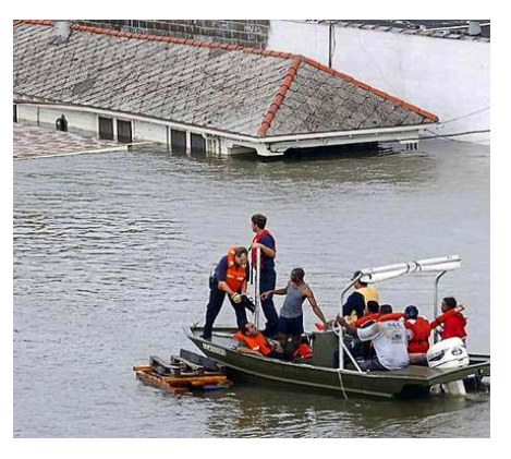
Imperial responds to client requests for assistance during the Gulf Coast Hurricanes

Contact us for a quotation on our services.