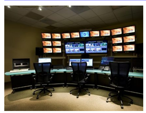
Security Command Center

IMPERIAL specializes in Distribution security. Distribution presents complex security tasks such as access control, employee screening, surveillance, and loss prevention. Wherever there is a concentration of valuable goods, criminals will try to infiltrate and exploit any security weaknesses. Let our IMPERIAL experts check for vulnerabilities in your security.