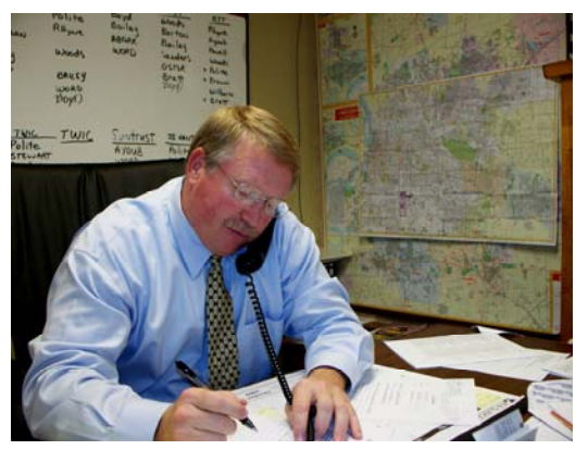
Site Surveys and client interviews are an integral part of the consulting process.