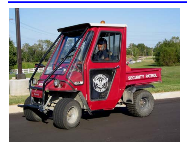
Utility Terrain Vehicle for Construction sites or off-road patrols.

A highly visible Security Patrol can provide a strong deterrent to criminal activity at your residence or place of business. Patrol drivers are specially selected and trained for their duties, and must maintain an excellent driving record. Our experienced Mobile Field Supervisors have an unsurpassed track record of satisfied clients.