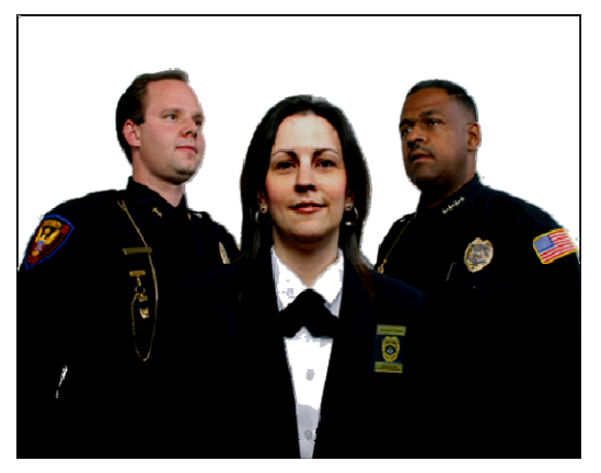
Imperial's Officers are World-Class