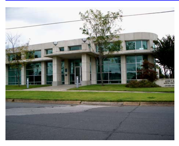
Office Security is vital to preserving Commerce.