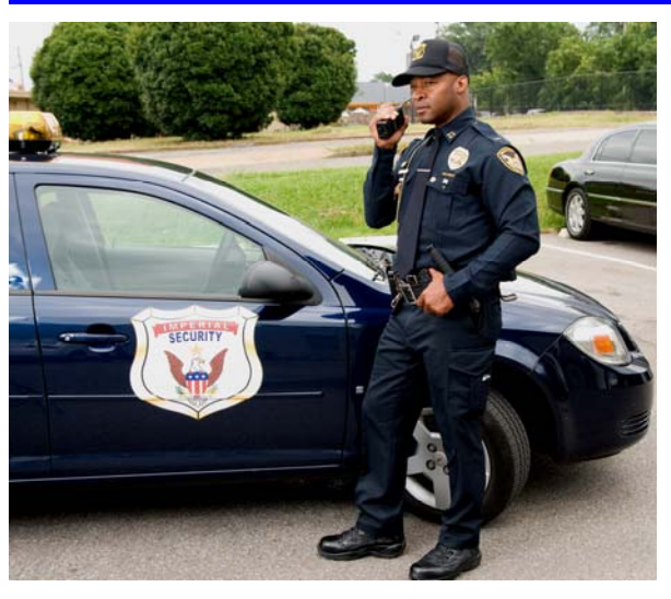
Patrol Vehicles and Mobile Field Supervisors