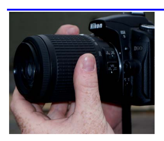
Our Investigators use state-of-the -art equipment.