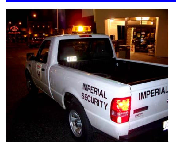
Retail security patrols deter theft and vandalism.

Retail security, in contrast to Distribution or Transportation security, presents different issues for the security professional, from premises liability to workplace violence, and shoplifting. Access control is less regulated for businesses open to the public; however, the security officer needs a strong command presence, conflict de-escalation skills, and the ability to deal with people. IMPERIAL's professional retail security specialists are specially selected and trained to fulfill this mission for our clientele.