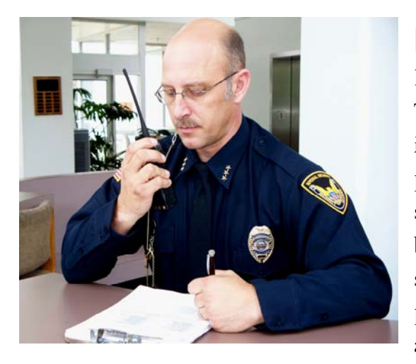
Retail Security Specialist