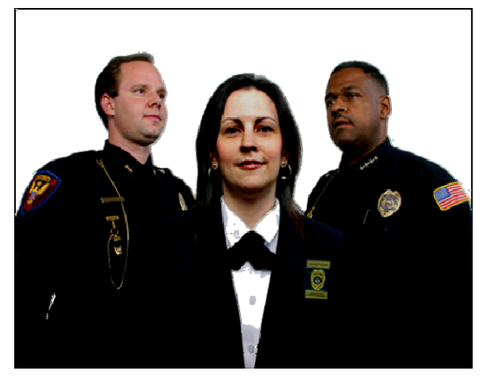
Imperial's Officers are World-Class