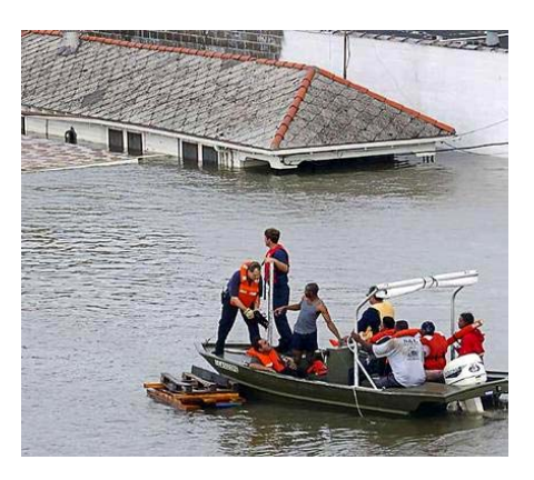
Imperial responds to client requests for assistance during the Gulf Coast Hurricanes