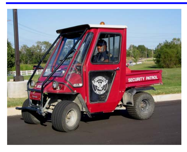
Utility Terrain Vehicle for Construction sites or off-road patrols.

A highly visible Security Patrol can provide a strong deterrent to criminal activity at your residence or place of business. Patrol drivers are specially selected and trained for their duties, and must maintain an excellent driving record. Our experienced Mobile Field Supervisors have an unsurpassed track record of satisfied clients.