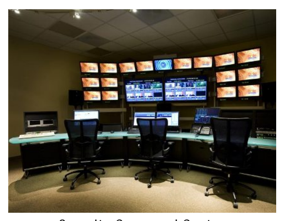
Security Command Center

IMPERIAL specializes in Distribution security. Distribution presents complex security tasks such as access control, employee screening, surveillance, and loss prevention. Wherever there is a concentration of valuable goods, criminals will try to infiltrate and exploit any security weaknesses. Let our IMPERIAL experts check for vulnerabilities in your security.