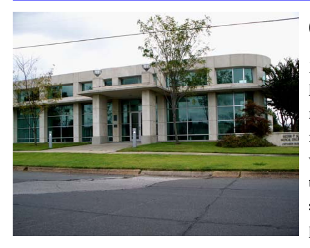
Office Security is vital to preserving Commerce.