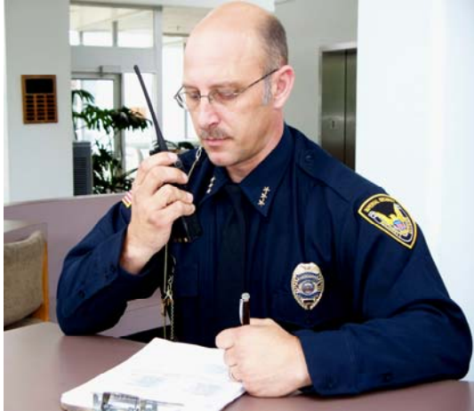
Retail Security Specialist