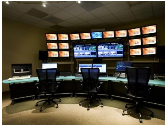
Security Command Center

IMPERIAL specializes in Distribution security. Distribution presents complex security tasks such as access control, employee screening, surveillance, and loss prevention. Wherever there is a concentration of valuable goods, criminals will try to infiltrate and exploit any security weaknesses. Let our IMPERIAL experts check for vulnerabilities in your security.