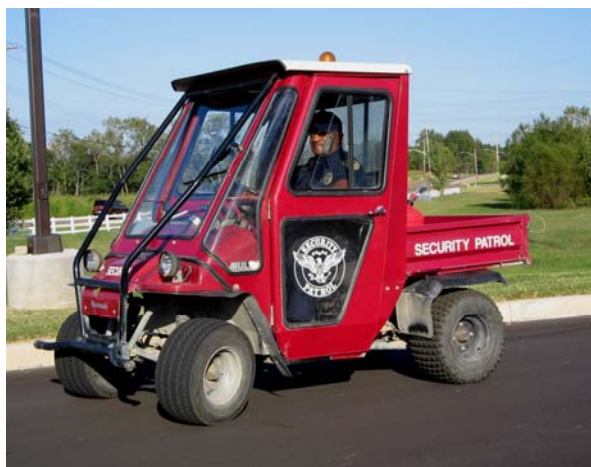
Utility Terrain Vehicle for Construction sites or off-road patrols.

A highly visible Security Patrol can provide a strong deterrent to criminal activity at your residence or place of business. Patrol drivers are specially selected and trained for their duties, and must maintain an excellent driving record. Our experienced Mobile Field Supervisors have an unsurpassed track record of satisfied clients.