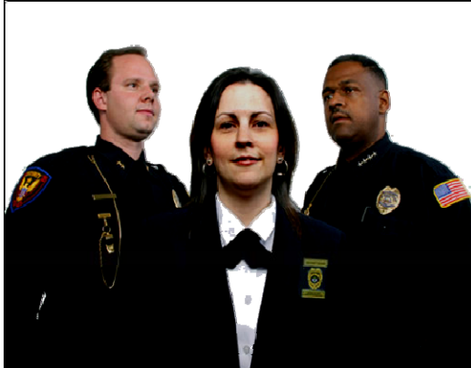
Imperial's Officers are World-Class