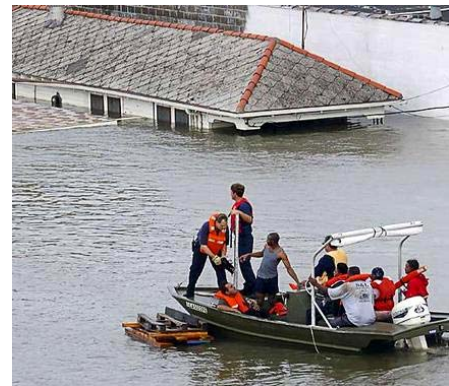
Imperial responds to client requests for assistance during the Gulf Coast Hurricanes