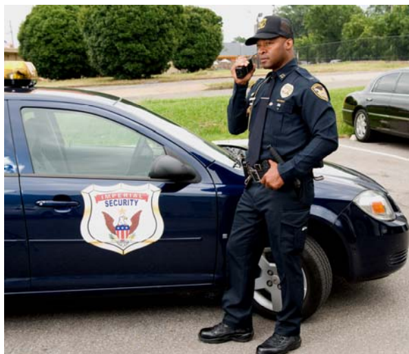
Patrol Vehicles and Mobile Field Supervisors