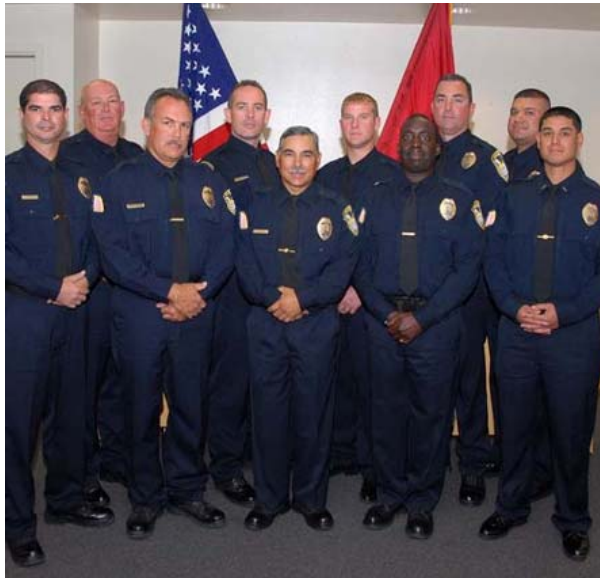
Security Training Class