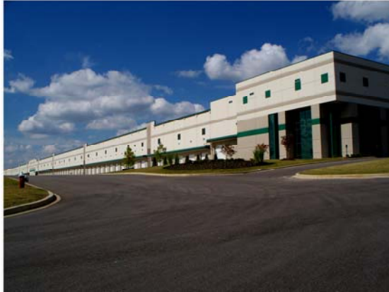
Large Distribution Facility